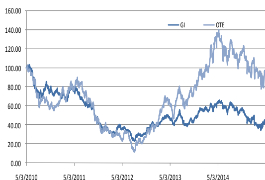
Stock Versus General Index (Last 5 Years, Base = 100)

Notes: (1) EATAM and equity are calculated excluding minorities. (2) P/E, P/BV and EV/EBITDA are based on current share price. n/c stands for non calculable.