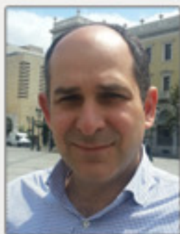
Trachanis Spyros Odyssey Venture Partners Greece